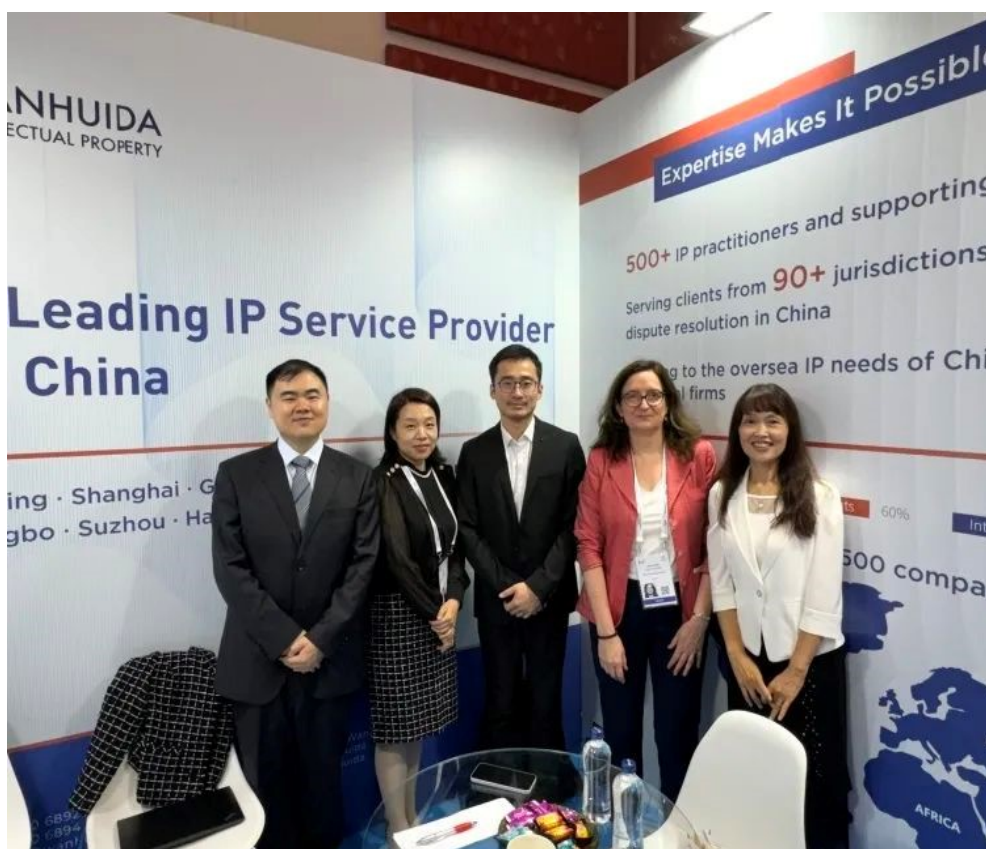
Wanhuida delegates & clients

The delegation leverages the Congress to engage with and network with trademark and patent practitioners all over the world.