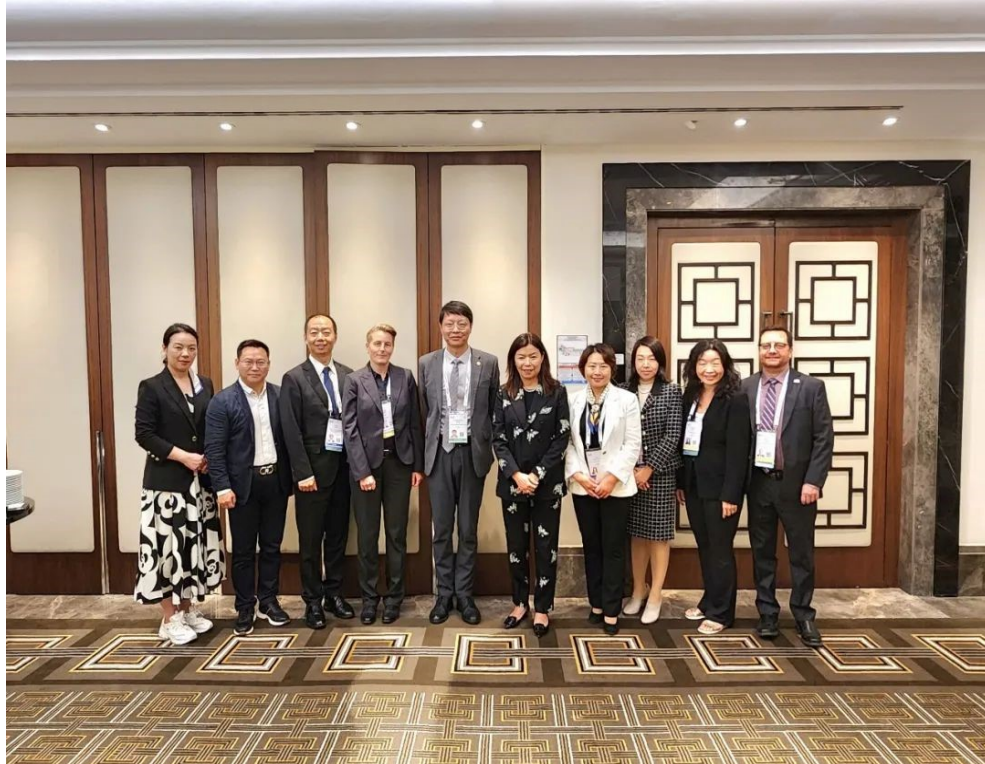
Attendees of the CTA-AIPPI bilateral meeting

The delegation leverages the Congress to engage with and network with trademark and patent practitioners all over the world.