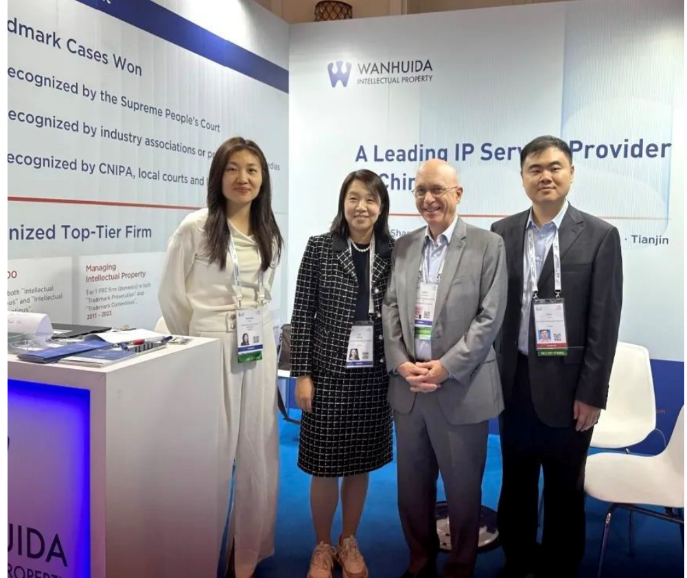
Wanhuida delegates & clients