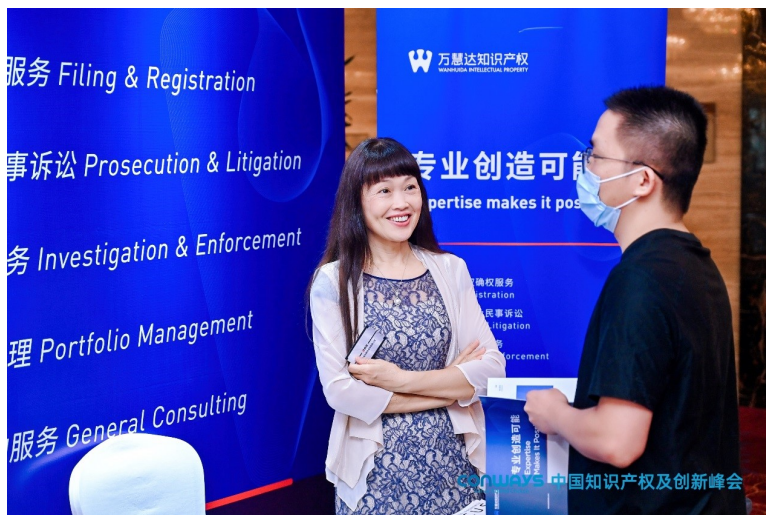
Visitor to the booth