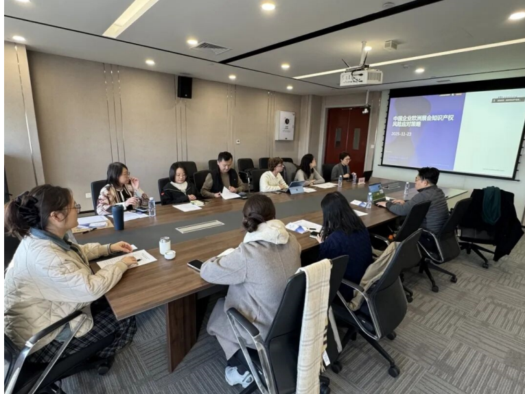
Corporate representatives attending the event offline